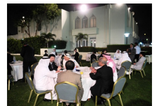
Social gathering with officials from SJAHI and JICC