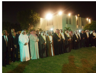
Attendees at the reception