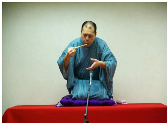
SHUMPUTEI SHOMATSU (RAKUGO)