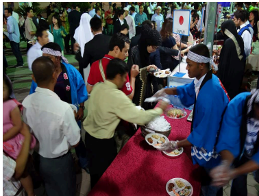
Japanese Consulate serving cuisine at the stall