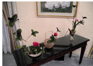
IKEBANA work 3