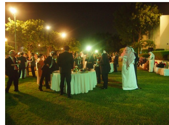
Attendees at the reception