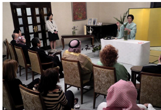
Demonstration of IKEBANA