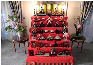
IKEBANA work 2, aside Japanese dolls