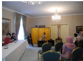
The demonstration hall