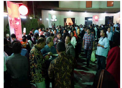
Participants enjoying foods