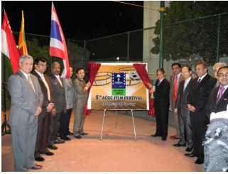
The unveiling ceremony