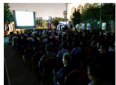
Screening of "Shodo Girls"