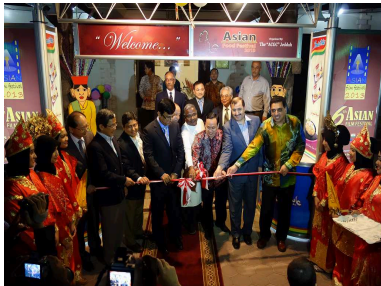
Ribbon Cutting for Food Festival 2013

Asian Food Festival 2013 was held in the evening of April 4 at the Residence of Consul General of Indonesia as a finale of the 6th Asian Film Festival. 13 Asian countries opened own stalls and treated the guests with their distinct cuisines. Japanese Consulate served Japanese cuisine such as "Sushi", which received ovations from the visitors.