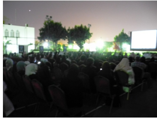
The film show at the special theater