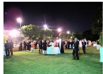
The reception hall