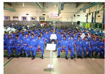
The 8th batch students of SJAHI