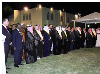
Attendees at the reception