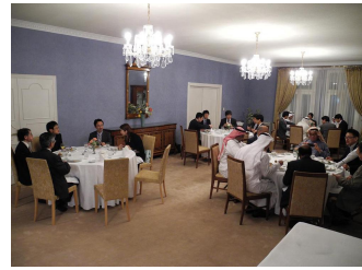
Meeting at the Residence