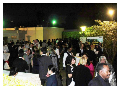
Attendees at the reception