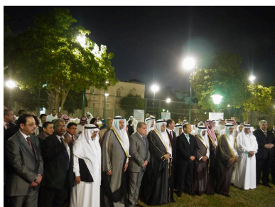
Attendees at the reception