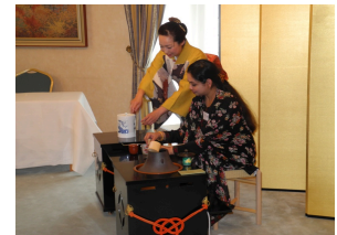
A participant experiencing the procedure of making tea