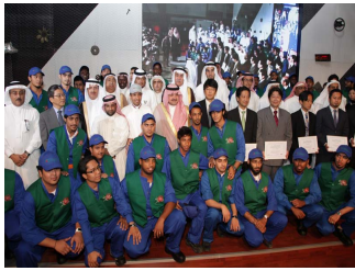
Photograph with H.R.H. Prince Misha'al