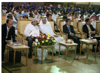
Attendees at the ceremony