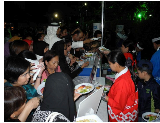
The booth of Japan

The number of participants to the Festival this year established a new record. It seems that the Food Festival is getting firmly fixed as a special winter event in Jeddah.