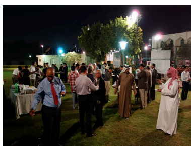
Attendee enjoying light meals

Saudi Government officials, Saudi businessmen, former Saudi exchange students, Jeddah consular corps, journalists, university students and Japanese residents enjoyed the films as well as light meals served.