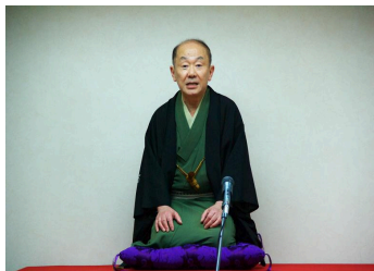
CHARAKU performing RAKUGO