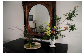
IKEBANA work 1