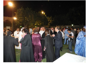
Participants enjoying the foods