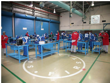
Scene of Skill Contest