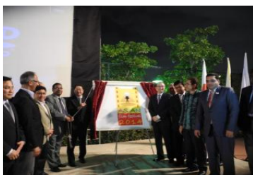
The unveiling ceremony