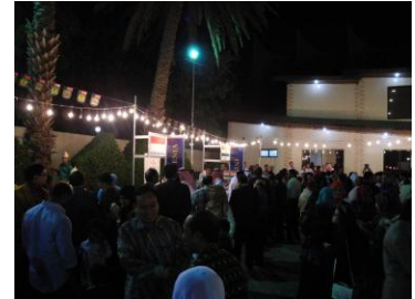
Participants enjoying foods