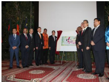
The unveiling ceremony

Total number of 206 participants of Saudi businessmen, former Saudi exchange students, Jeddah consular corps, journalists, university students and Japanese residents enjoyed the film. The participants also enjoyed delicious Japanese foods prepared by chef of the Japanese Consul-General.