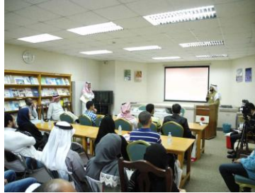
Explanation from SAJGA members