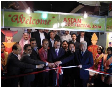
Ribbon Cutting for Food Festival 2014i

The Asian Food Festival 2014 was held in the evening of March 31 at the Residence of the Consul-General of Indonesia as a finale of the 7th Asian Film Festival. The 13 Asian Consulates General opened their own stalls for offering their typical food. As for the Japanese Consulate, it served Japanese Sushi and fried chicken, which the visitors enjoyed to full extent.