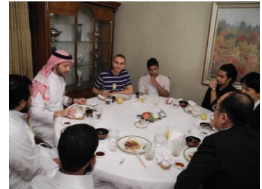
Saudi students with Japanese Association