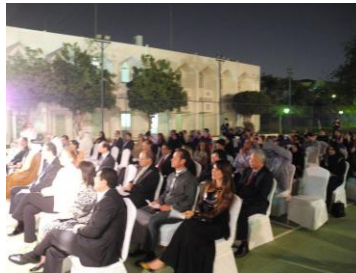
The audience is watching performance