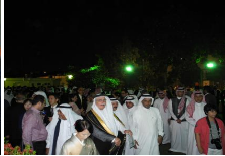
Attendants at the reception