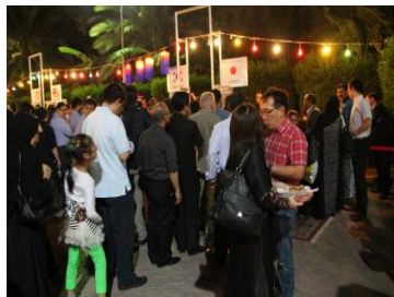
Participants waiting for the Japanese food