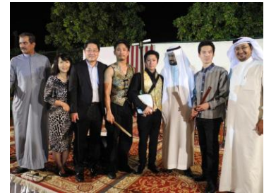
The musicians and the audience