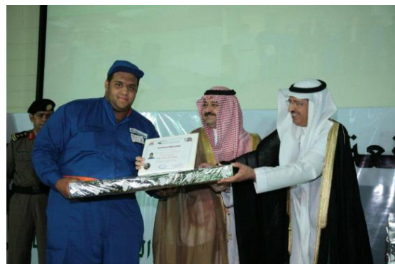
Commendation to the excellent student