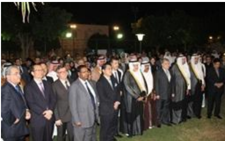
Attendants at the reception