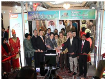
Ribbon Cutting for Food Festival 2015

As for the Japanese Consulate, it served Japanese Sushi and grilled chicken, which the visitors enjoyed to full extent.