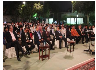
Participants in the venue