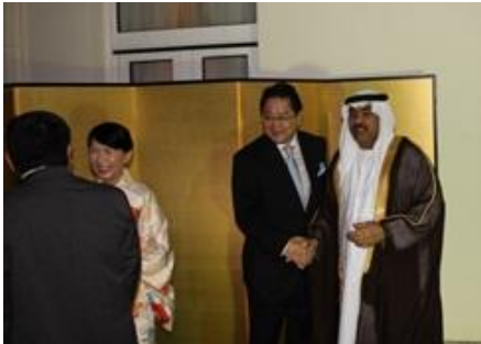
Mr. Yamaguchi with guests

Saudi local distributors of Japanese automobiles displayed latest Japanese car models in the venue to advertise the Japanese products, which greatly attracted the attendants.