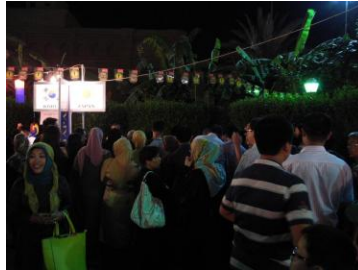
Participants waiting for the Japanese food