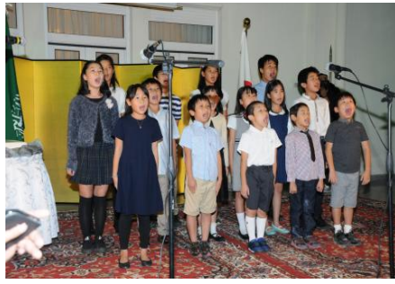
National anthem performed by Japanese students