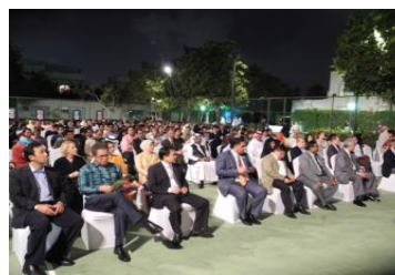
The audience watching the film