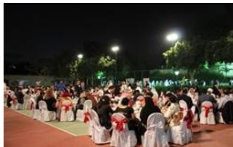
Attendants at the reception