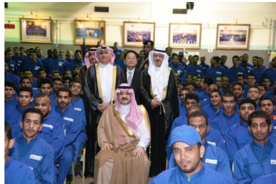
The 11th graduates with honorable guests