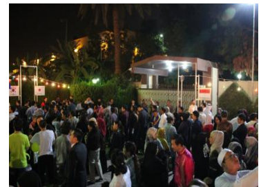
Participants enjoying Food Festival